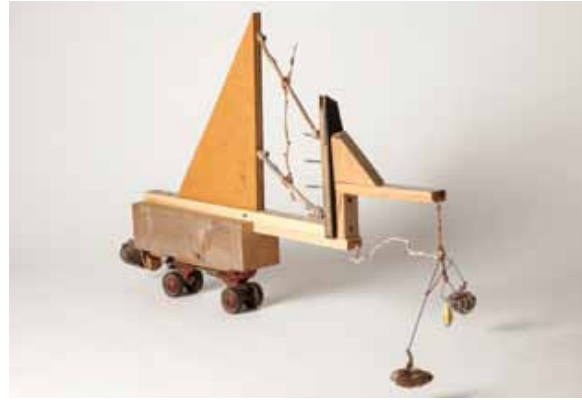
Arthur Simms Roman Soldier , 2010

leaves the wood exposed in his rough, tangled constructions that typically incorporate nails, rope and wire. Wray usually uses the wood to fashion armatures that become substructures buried beneath multiple layers of foam and papier-mâché.