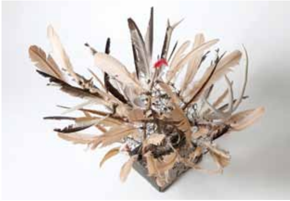
Arthur Simms Face Mon , 2014