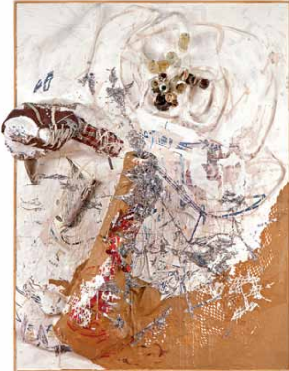
Randy Wray Limb , 2011

particle smashers used in physics experiments. The work is mounted on actual casters to facilitate easy rolling. Many of his sculptures appear top heavy and lean to one side as if in the act of falling or rising. Multi-colored shredded paper often covers surfaces creating a vibratory optical sensation of motion. Old Converse sneakers allude not only to the artist's literal movement but also to his agility in his artistic explorations. At times his abstract forms evoke vehicles such as trains, ships and horses. In Wray's work, transportation serves as a metaphor for transformation.