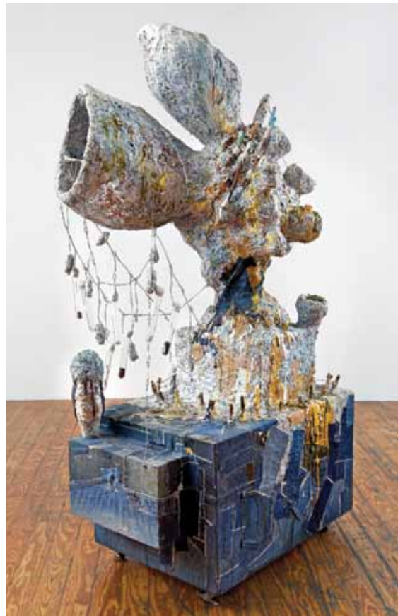
Randy Wray Accelerator , 2011