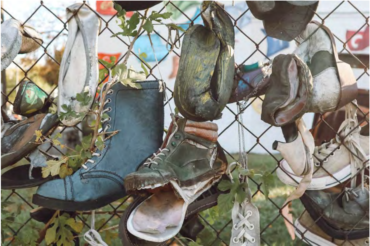
Discarded soles. | Photo: Sarah Bence

According to the app, one installation—a pile of shoes topped with a plastic angel—is called Haiti . To Guyton, the shoes represented all those who died in Haiti's 2010 earthquake. New in 2020 is a disposable white mask covering the angel's face.