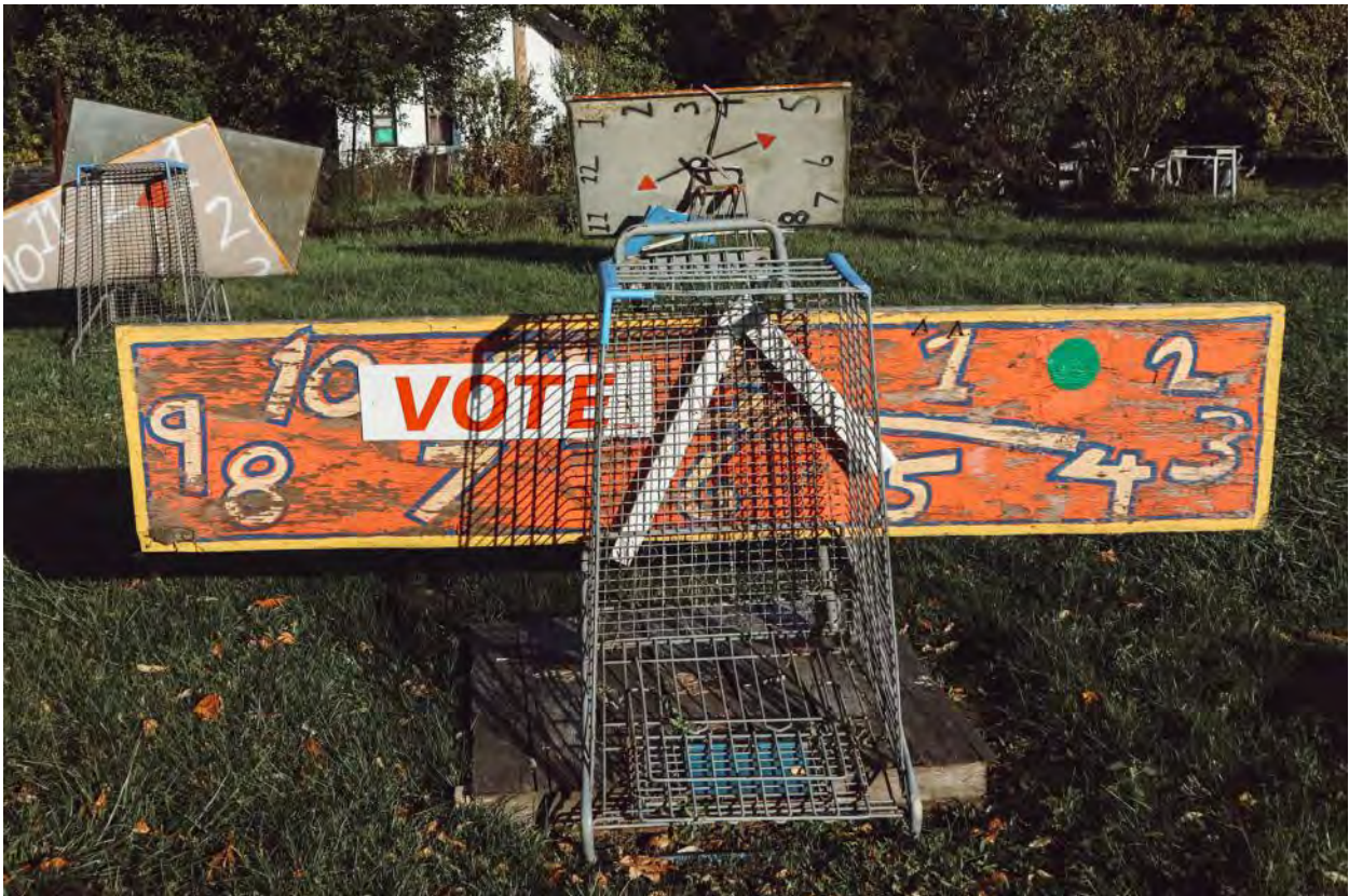
The project itself has been controversial in Detroit since its inception.