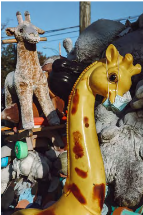
Giraffe toys.

I remember her friendly, mask-less face and how we walked through the installations together, without a thought to the trajectory of airborne particles leaving each other's mouths.