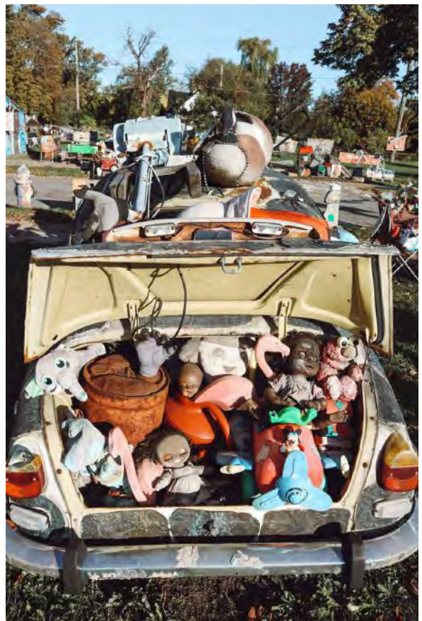
A trunk filled with toys.