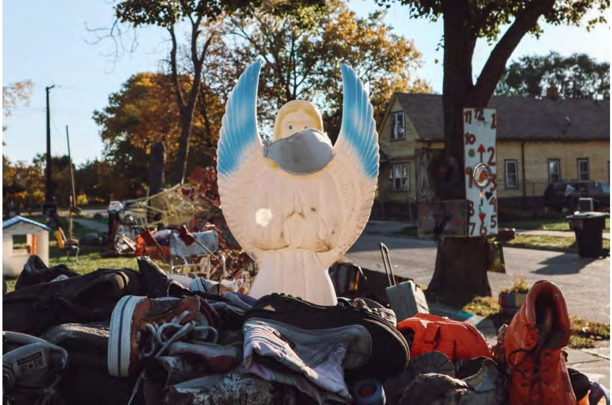
An angel wears a face covering.