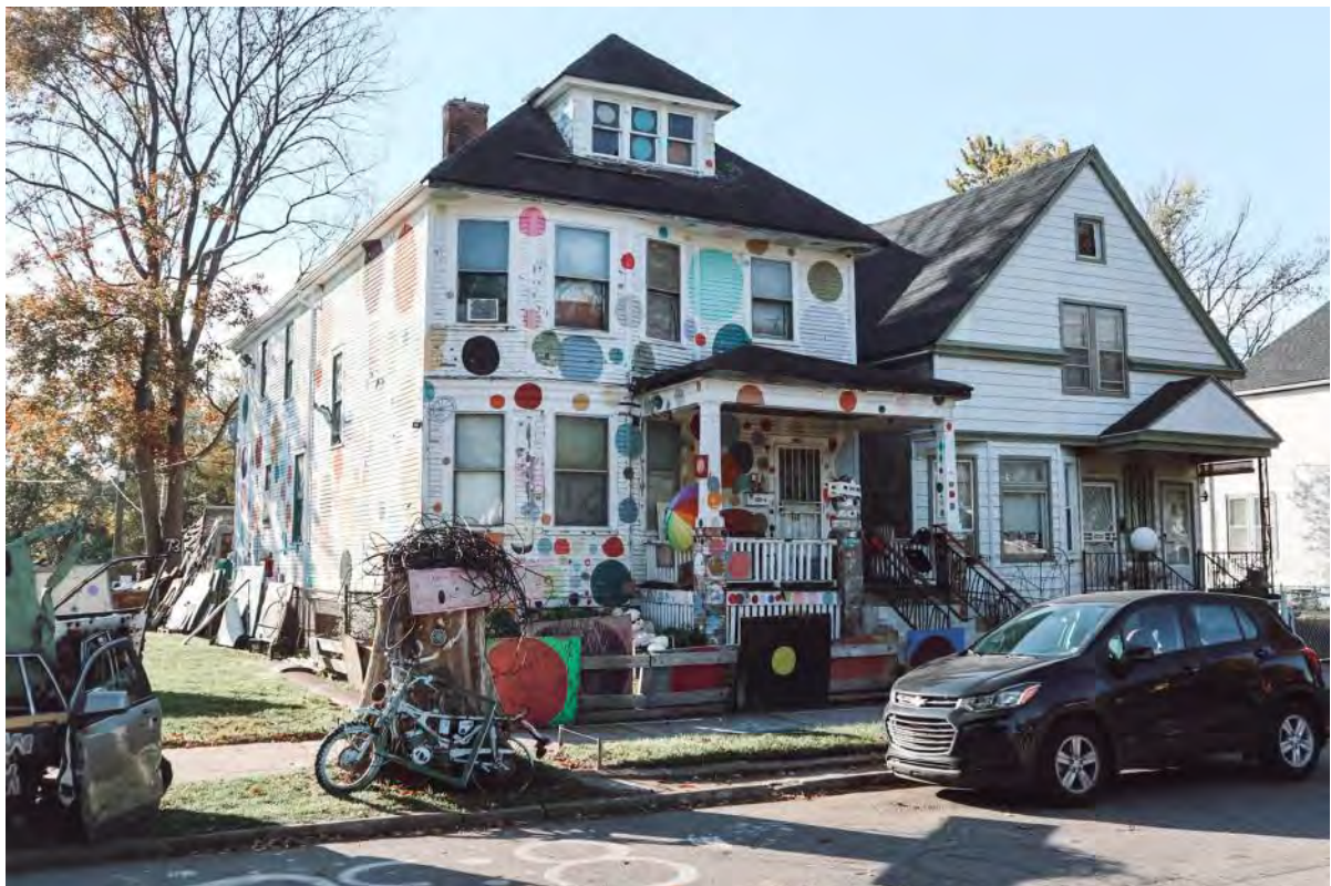
The Dotty Wotty House.

Using the GPS-based app to guide me, I weave through the various installations: A hot pink hummer peeps out from the grass where it's half buried. Shoes, which symbolize souls ("soles"), are strung along fences and trees. Abandoned cars are bursting with found dolls.