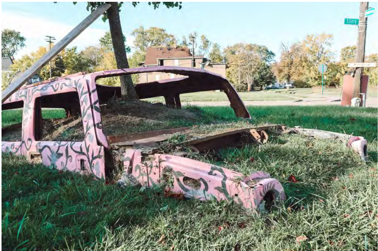
A sunken car frame. | Photo: Sarah Bence