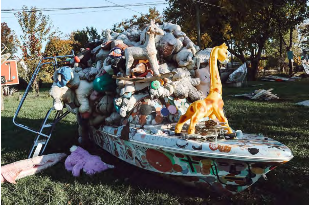
A boat piled with stuffed animals.