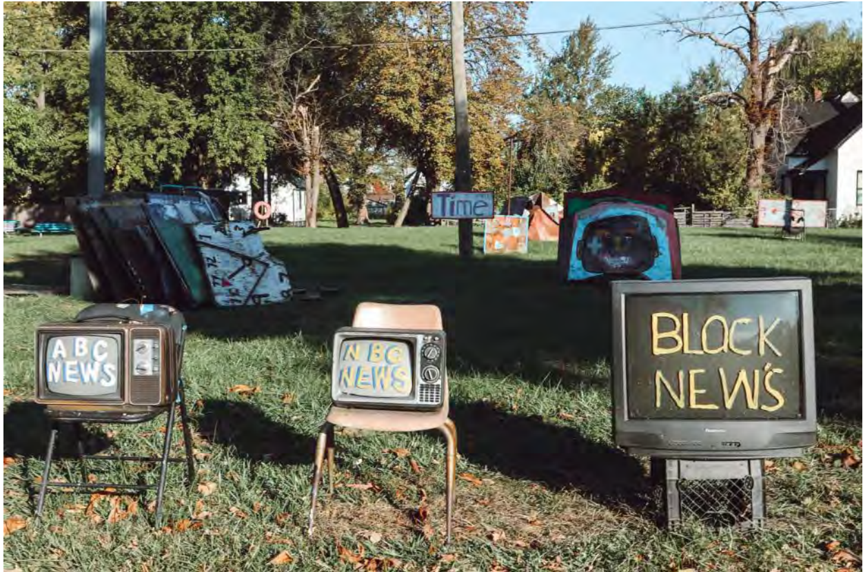
Three TVs.