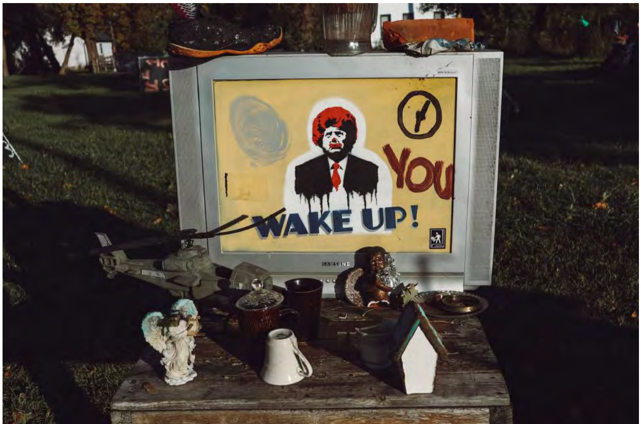
The Heidelberg Project is full of found objects, like abandoned teddy bears, old TVs, and broken-down cars.