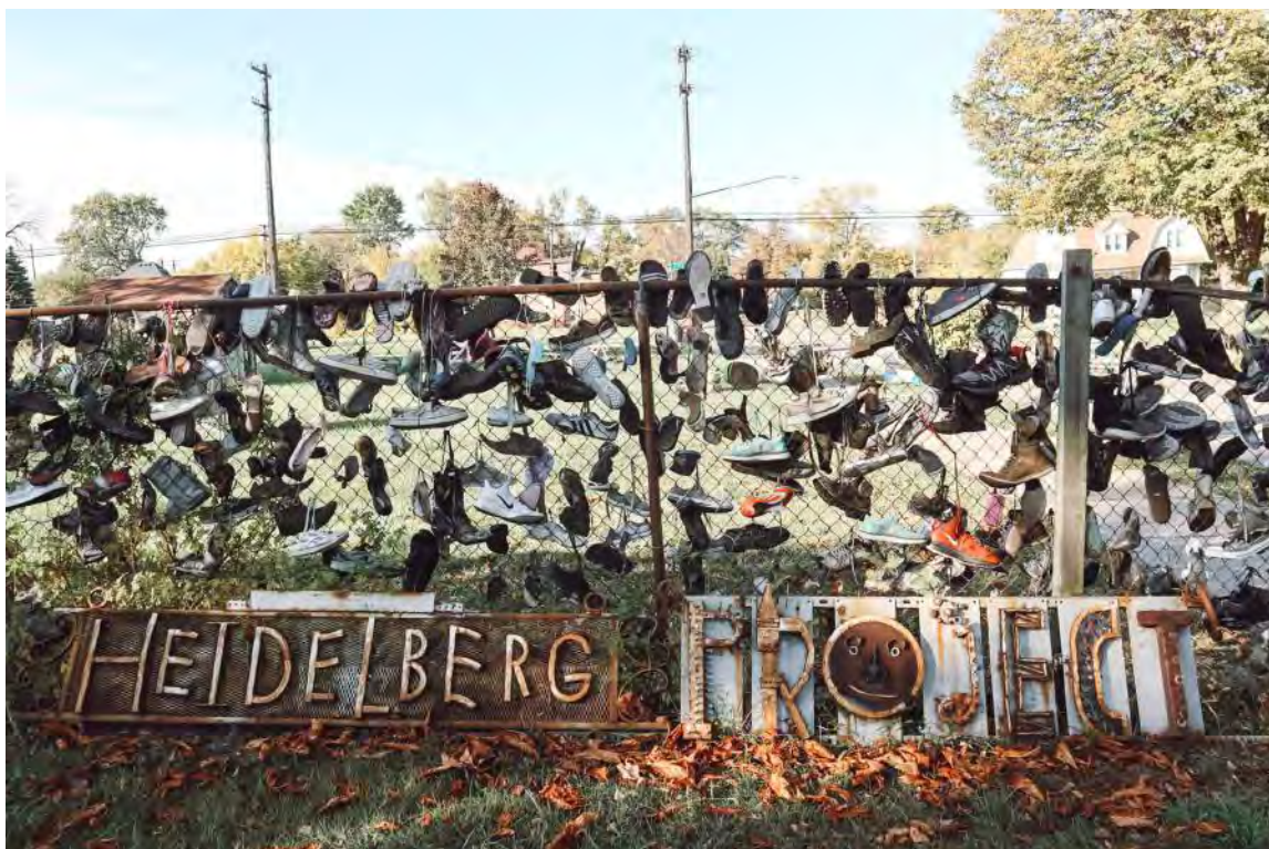
A fence lined with shoes.

In the face of arson, demolition, and see-sawing Detroit politics, the Heidelberg Project has continued on, constantly evolving, and it often incorporates these obstacles into its artistic story.