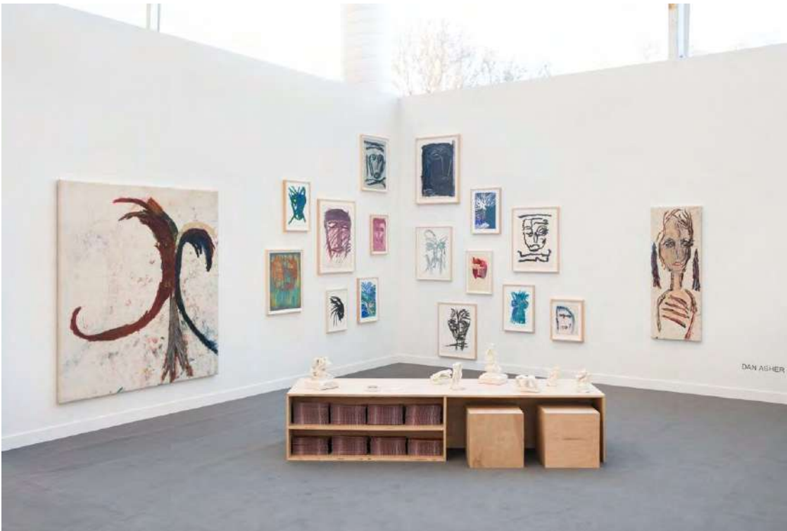
Installation view of Martos Gallery's booth at Frieze New York, 2018.