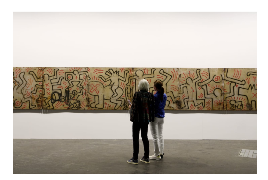
Installation view of a work by Keith Haring, presented by Martos Gallery in the Unlimited sector of Art Basel in Basel 2024.